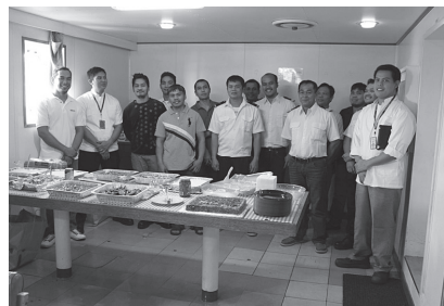
The crew at their farewell luncheon