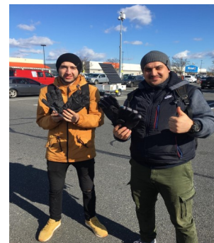
2 Crew of the MSC Julia R. were very excited for gloves and hats as they just came up from Miami

Many seafarers come from tropical climates in the developing world and are completely unprepared for our cold North Atlantic winters. Your financial donations, and items contributed to our Ditty Bag program, enable us to provide jackets, hats and scarves, and work gloves. As the weather grows colder, we are especially grateful for your dedication to SCI and to the seafarers