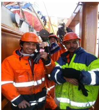
Crew of Shippergracht at Pier 80. Happy to receive winter gloves & hats